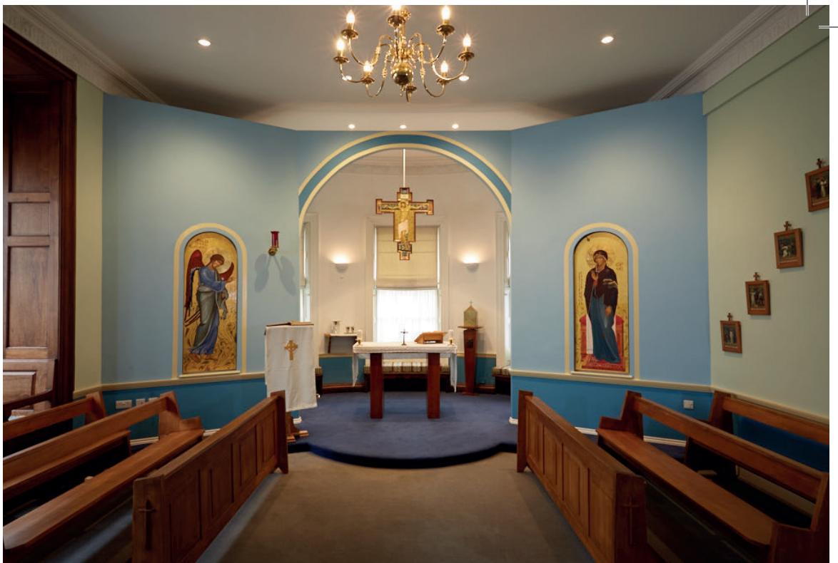
Chapel of the Annunciation