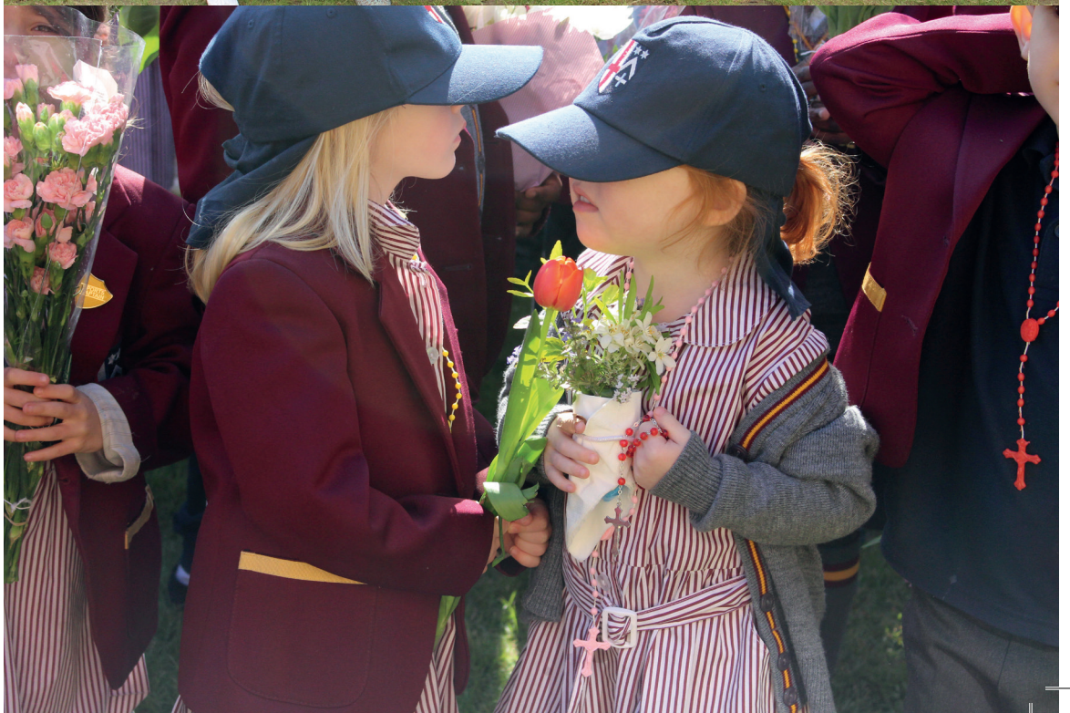
Junior Rosary Procession May 2018