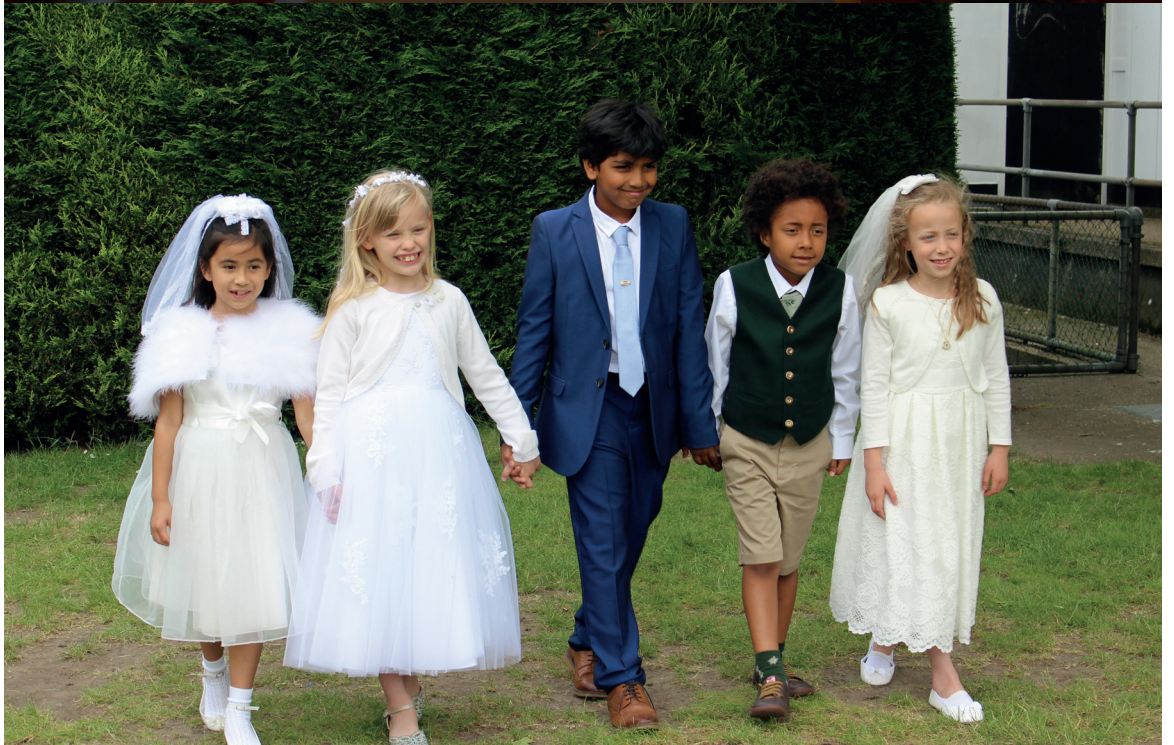
First Holy Communion June 2018